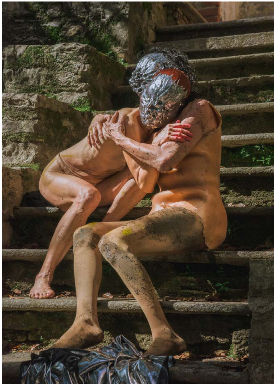
performance at Bally Foundation, Lugano

https://vimeo.com/1036525510 password: glitter