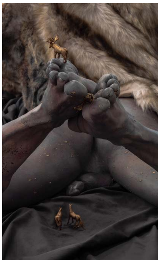
L'Agonie de l'Eros (details)