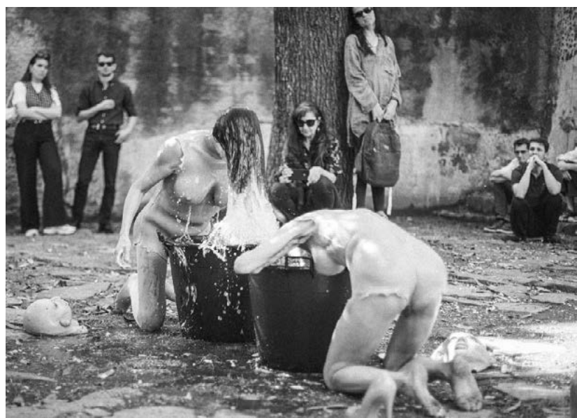
performance at Bally Foundation, Lugano