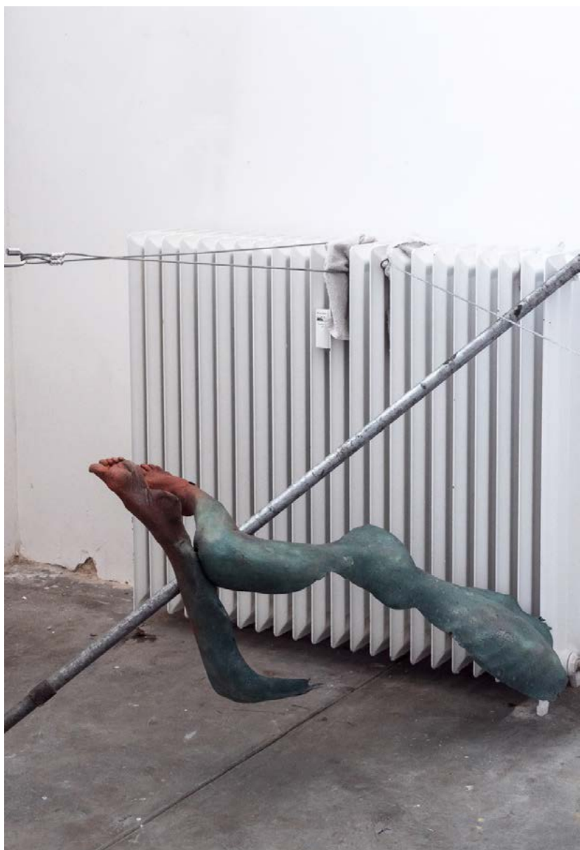
Figures On Sticks (details)