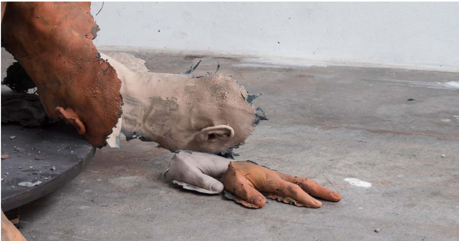
Body Rising (details)