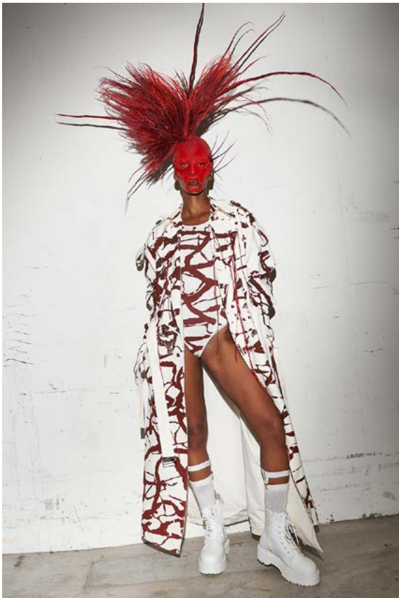
Creatures of the Unknown / collection of 10 masks for maison.blanche.swiss 2024 / wearable sculpture / silicon, pigments, synthetic hair and fur / variable dimensions mode suisse '24 - Kunsthalle Zürich