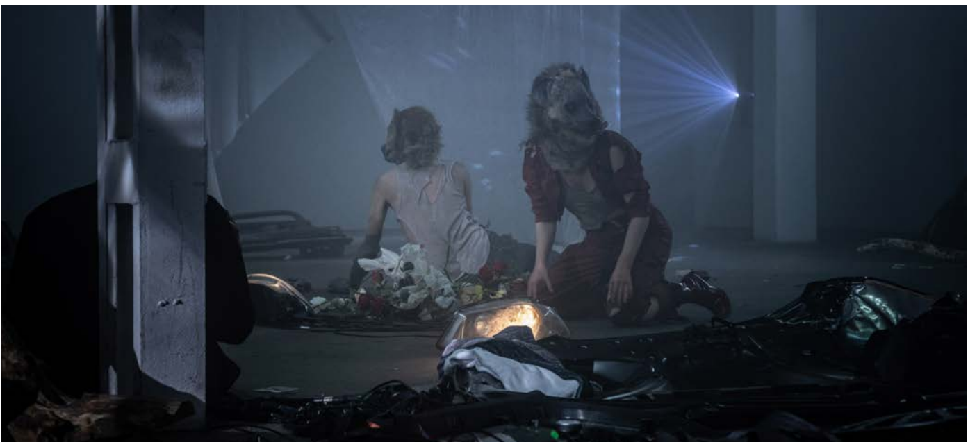
presentation at Fonderie Kugler, Genève