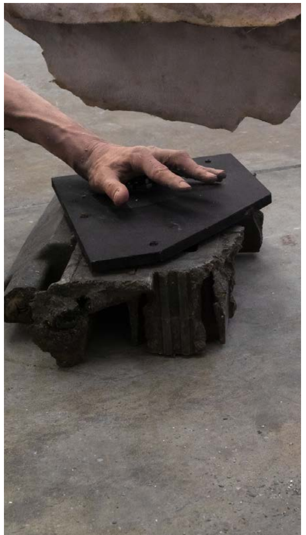
The More You Pull (details)